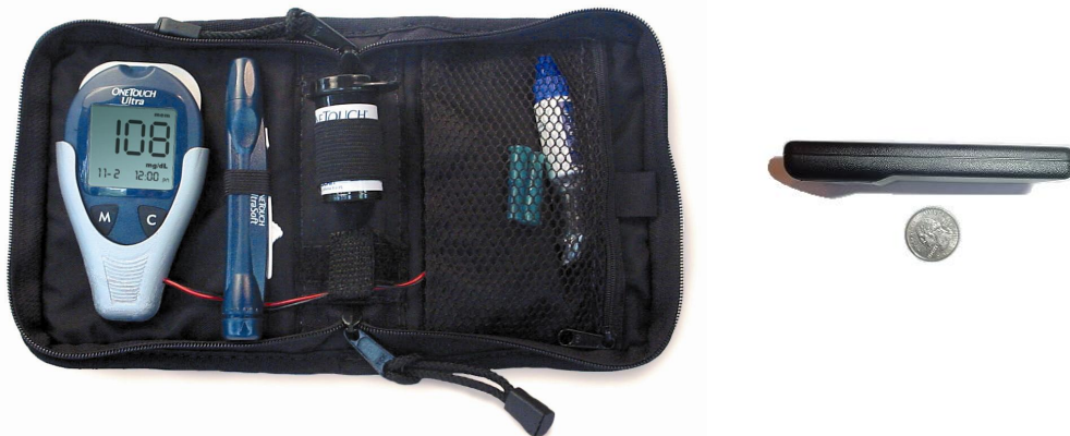
Diagram 1. GlucoMON® device including the hidden wireless computer (shown with OneTouch® Ultra® from LifeScan, Inc.)

This automatic time keeping method used to synchronize the current generation glucose meter clock to the world’s most accurate atomic clocks results in the world’s most accurate blood glucose data. Unfortunately, other systems do not have this automatic data integrity check which then results in unusable data, data that is hard to work with or even worse, decisions made without realizing that the timestamps are not accurate. For many reasons, the internal clock of these glucose meters is often times incorrect due to user error and/or mechanical design flaws which allow the clock time to change due to static electricity, dropping, etc...With the GlucoMON, the meter’s clock is always accurate and the data is reliable.